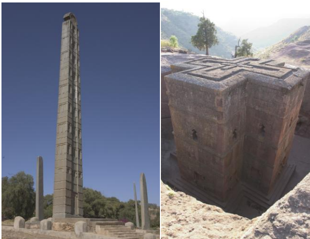
(l-r) Obelisks from the ruins of the ancient city of Aksum and the rock-hewn churches of Lalibela.

Ethiopia has eight other sites on the UNESCO World Heritage List which include: the ruins of the ancient city of Aksum ; the fortress-city of Fasil Ghebbi ; the fortified historic town of Harar ; the Lower Valley of the Awash ; the Lower Valley of the Omo ; the Rock-Hewn Churches of Lalibela ; Tiya and Simien National Park .